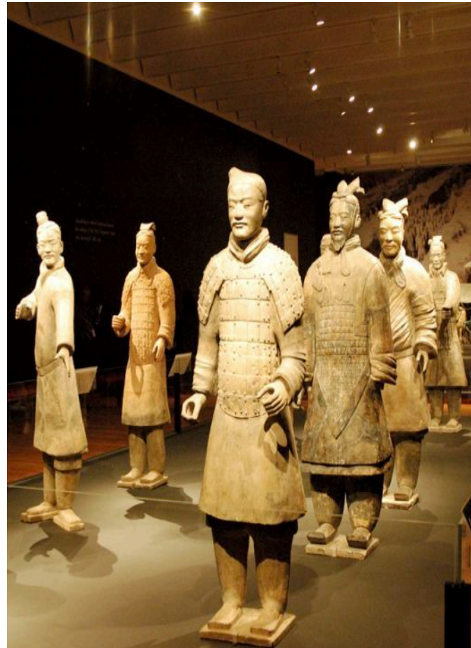
Early Chinese Art (Ritual Art)