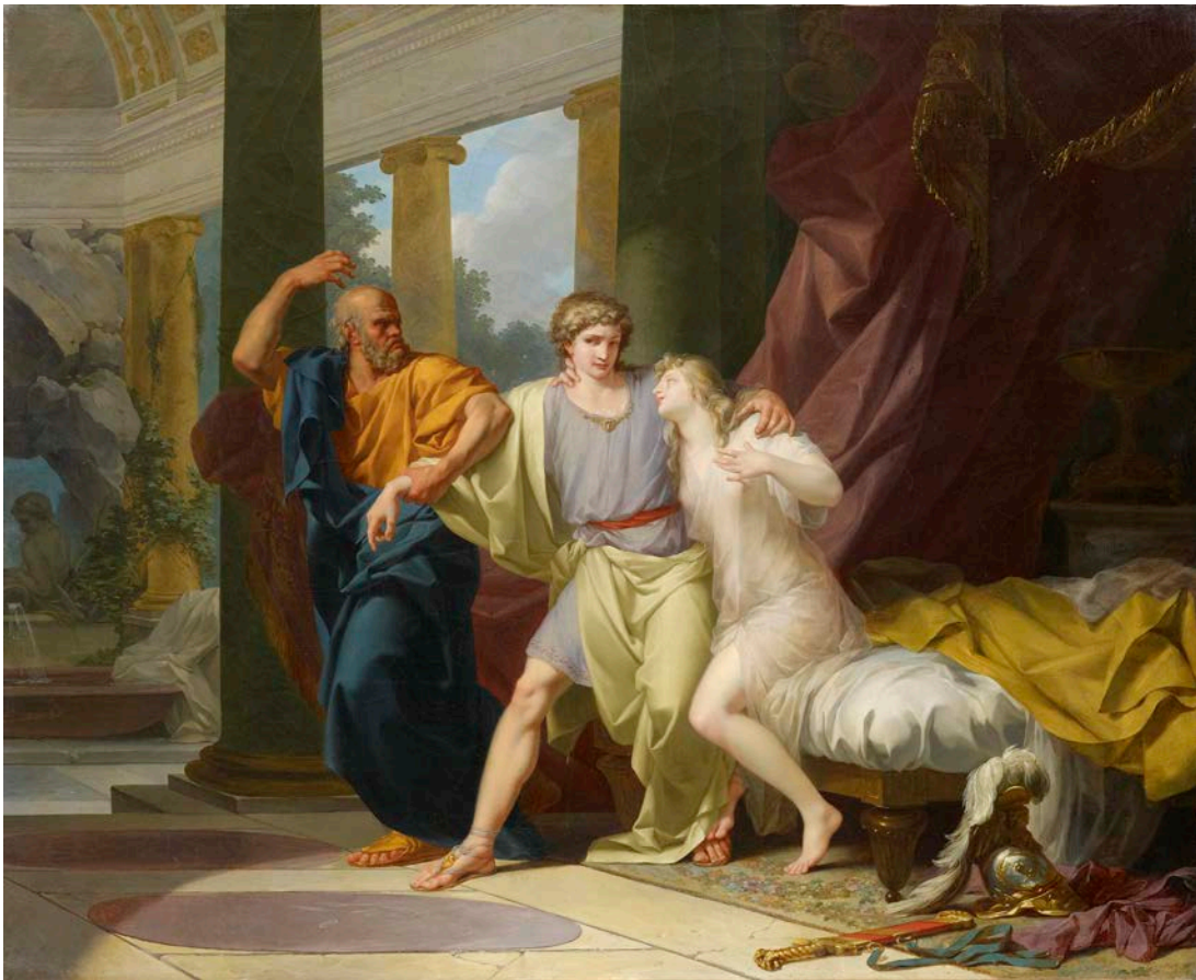
Jean-Baptiste Regnault, Socrates Tearing Alcibiades away from Sensuality , 1785.