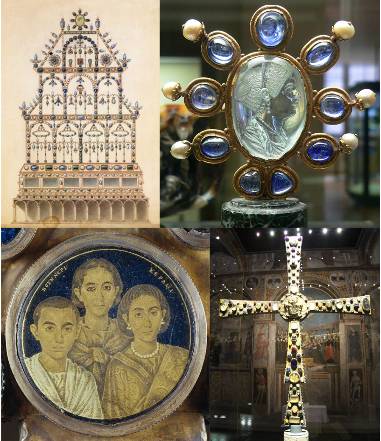
Top Left: Escrein de Charlemagne from St Denis , watercolor 1791.