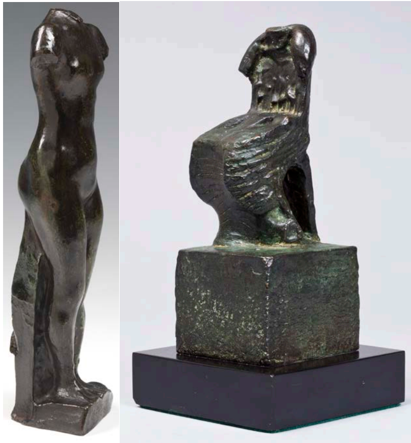
Left: Auguste Rodin, Standing Torso , bronze, 1882