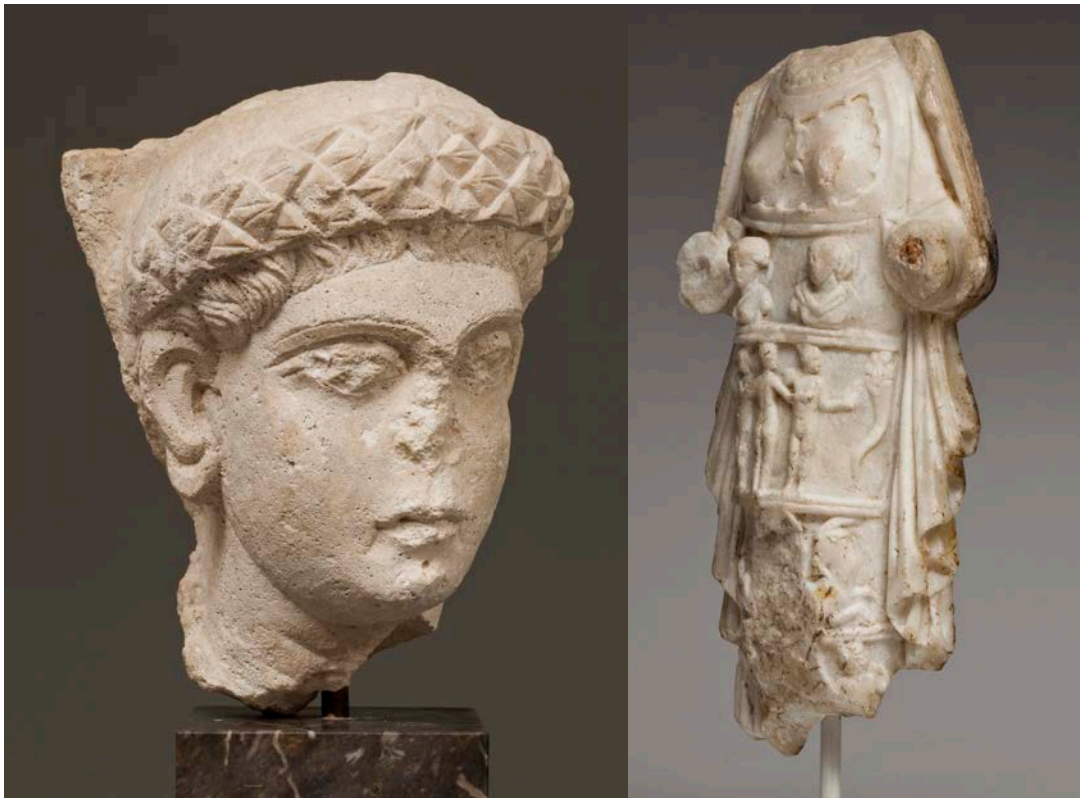
Left: Late antique limestone head of a male, perhaps 4 th century AD