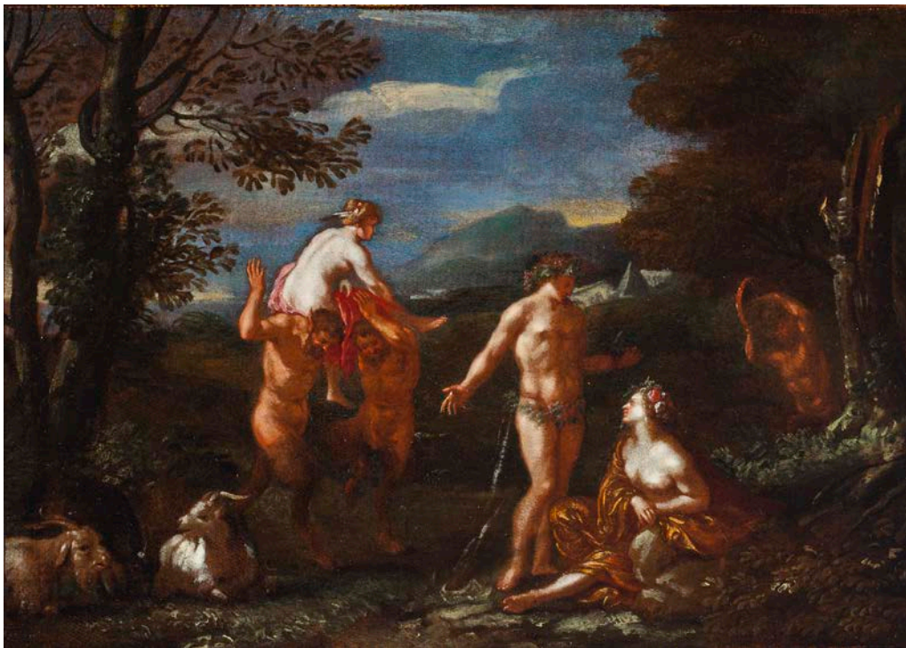
Filippo Lauri, Bacchanal , undated