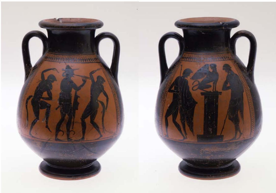
'Eucharides Painter' c 490 BC, Black figure Pelike with Hermes and Satyrs/ Sphinx and male figures