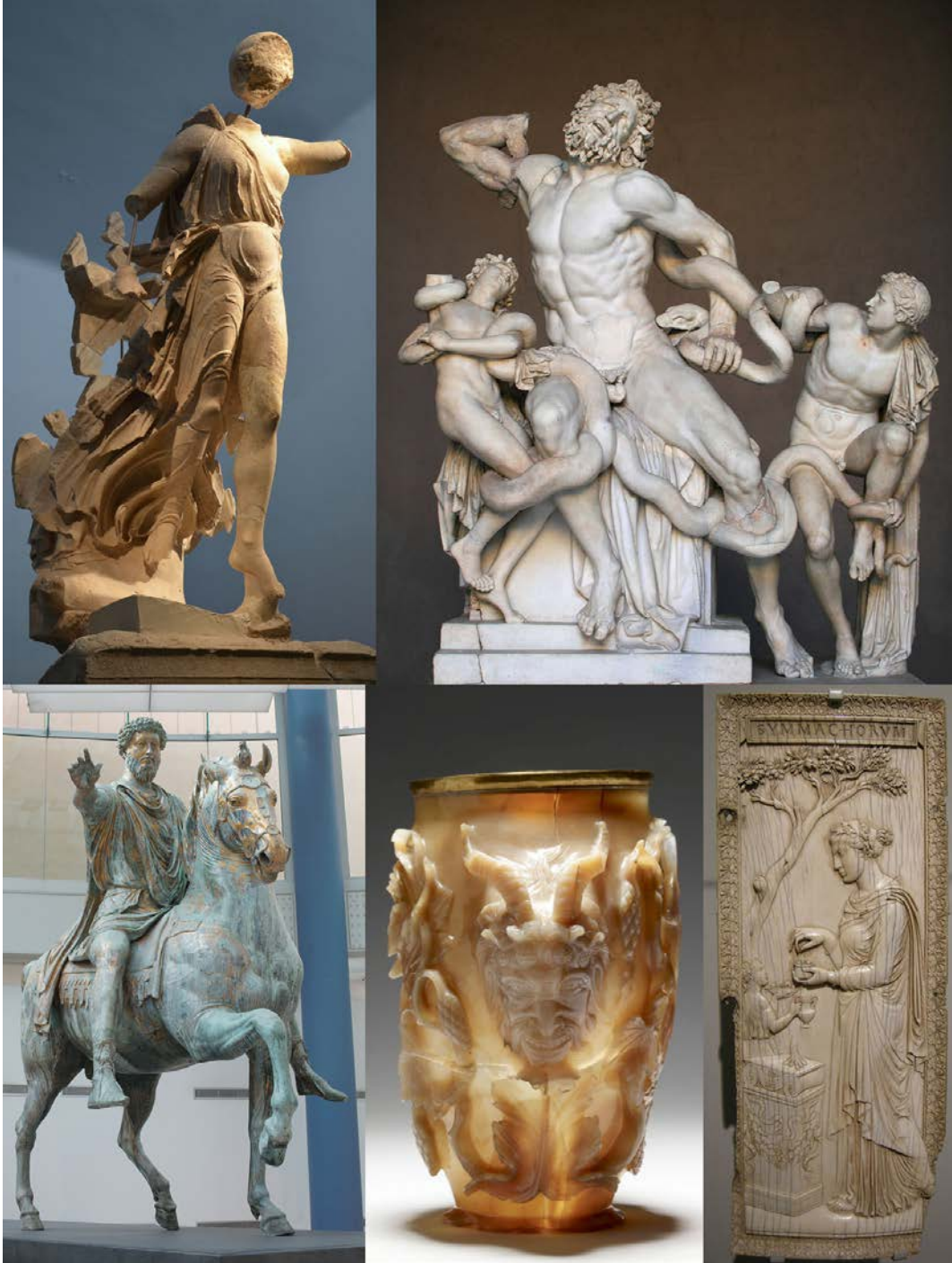
Top Left: Nike of Paionius, Olympia, C5 BC