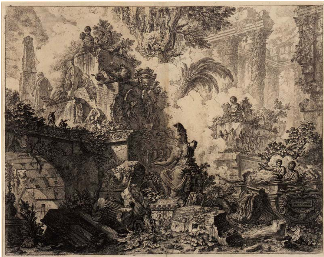
Giovanni Battista Piranesi, Ruins with the Statue of Minerva , From Vedute di Roma , frontispiece, 1748