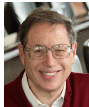
Richard Epstein Law & Economics