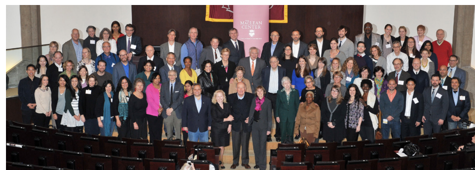
MacLean Center Fellows, Faculty and Board Members at the 27th Annual MacLean Conference

The MacLean Summer Intensive Program is unique. It offers fellows a 5-week intensive experience that includes more than 90 lectures and seminars taught by 35 MacLean Center Faculty. The intensive program offers lectures (“mini-courses”) on the following topics: clinical ethics, ethics consultation, mediation and negotiation, end-of-life care, research ethics, health policy and health disparities, surgical ethics, pediatric ethics, reproductive ethics, psychiatric ethics, and the ethics of cancer and big data.