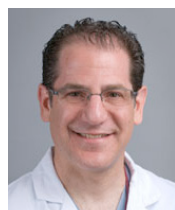
Ross Milner Surgery