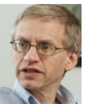
Harold Pollack Public Policy