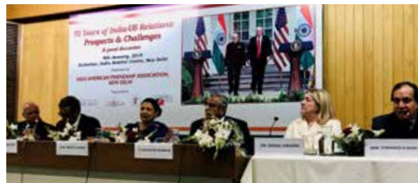
ABOVE International Houses Worldwide alumni event held in conjunction with the UChicago Center in Delhi, the India Habitat Centre and the Indo-American Friendship Association.

Over 200 alumni and friends enjoyed the program 70 Years of India-US Relations: Prospects and Challenges which included a distinguished panel of diplomats, journalists, academics and foundation representatives.