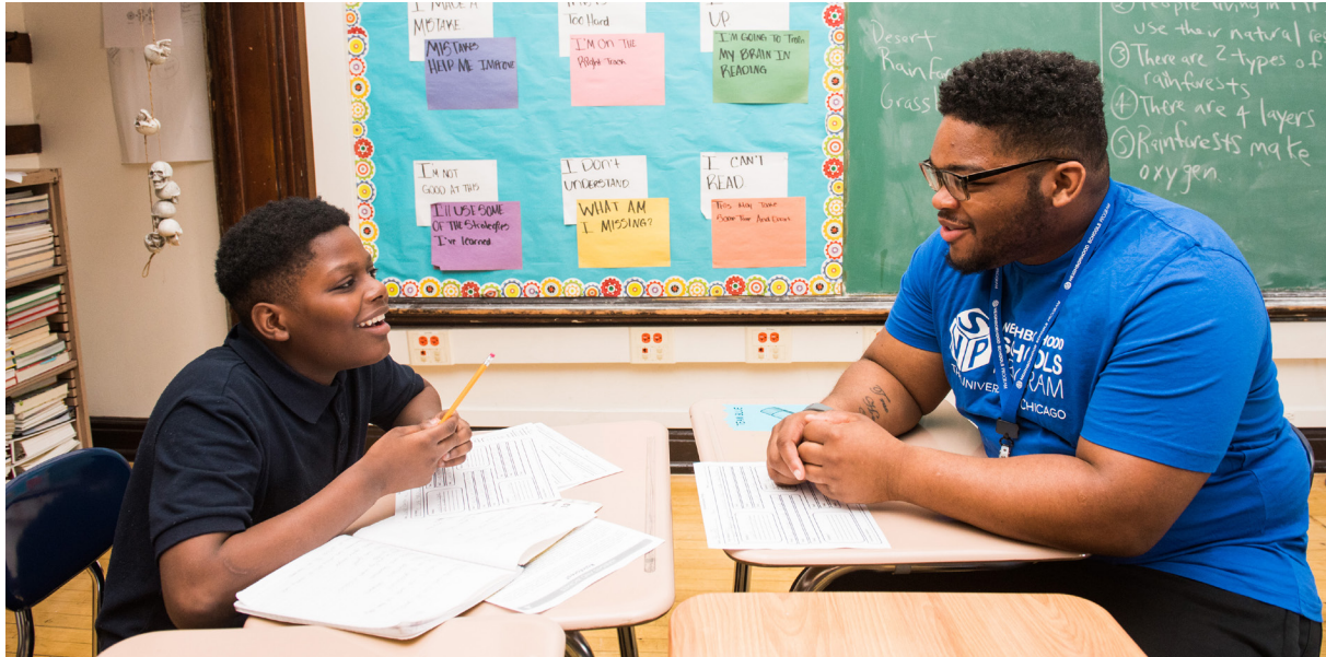
A UChicago student from the Neighborhood Schools Program works with a student at Burke Elementary School in Washington Park.

Providing opportunities for meaningful scholarly, professional, and personal engagement with our community in a spirit of partnership and collaboration.