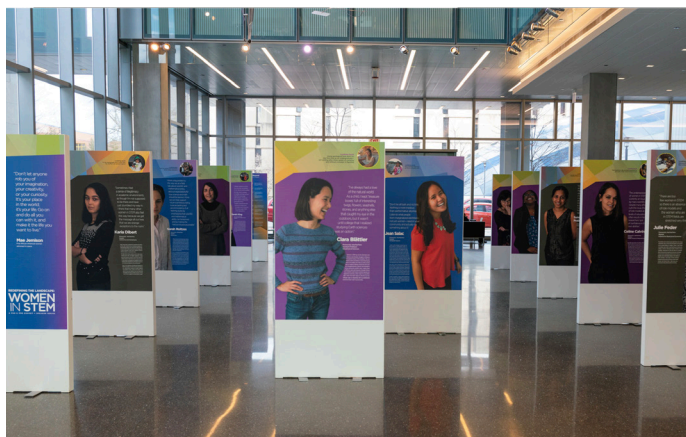
Redefining the Landscape: Women in STEM Exhibit and Speaker Series highlighted several women who are learning, teaching, and researching in the Physical Sciences Division and the Pritzker School of Molecular Engineering.