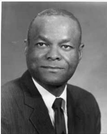
Scanned at the American Institute of Physics