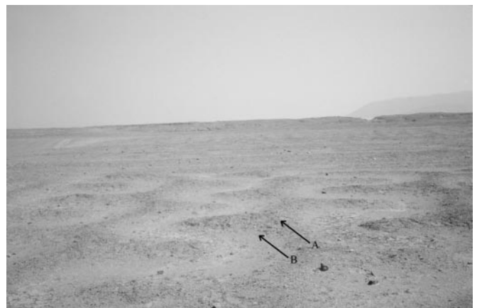
Fig. 5. Extensive Chimú period irrigated field system south of the urban center of Farfán. Note the field surfaces (A) and secondary and tertiary canals (B) that were linked to a large intravalley canal and aqueduct system with an intake near the site of Talambo (see Fig. 1).

A second response to extreme water resource fluctuation (ranging from severe drought to catastrophic flooding) entailed the development of anticipatory agricultural infrastructure. This infrastructure included a network of redundant irrigation canals measuring 30–40 km in length that supplied water to various sectors of the valley (Fig. 5). The north side of the Jequetepeque Valley alone contains >400 km of preserved, pre-Hispanic canals. Given the local hydrological regime, these canal systems could not have been supplied with sufficient river or spring water to function simultaneously. That is, at any given time, only part of the system could have drawn irrigation water. This implies that communities regulated the flow of irrigation water to different sectors of the valley through a coordinated means of water scheduling. The construction of redundant canal networks and the development of flexible, opportunistic agricultural systems served essentially as a diversification of landscape capital. If one part of the network was destroyed, or fell into desuetude, another