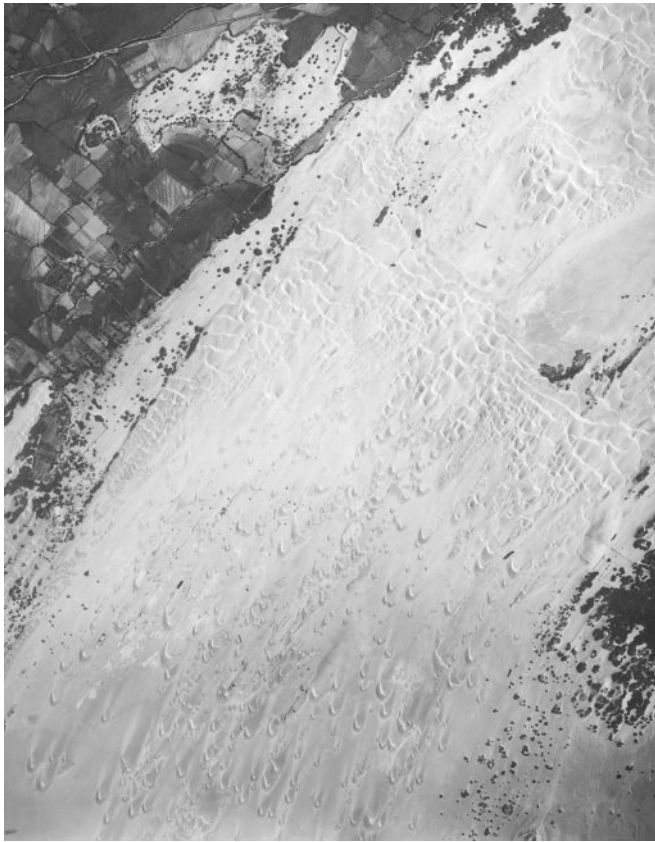
Fig. 3. Aerial photograph of duneation processes on the south side of the Jequetepeque Valley. Note the extensive field of active barchan sand dunes.

mental change varied significantly between the Moche and Chimú, illustrating variability in effective human adaptation to environmental uncertainty.