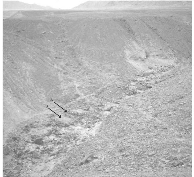
Fig. 4. Late Moche period opportunistic agricultural systems consisting of sequential cultivation terraces (A and B), check dams, and reservoirs fitted to a narrow quebrada.

One common local response to environmental uncertainty was the development of flexible, opportunistic agricultural regimes. These include multiple, small-scale water management systems arrayed along coastal hills. Such systems maximized runoff from springs and occasional rainfall (Fig. 4). They are spatially extensive and associated with the Late Moche, Post-Moche, and, to a lesser extent, Chimú cultures. These flexible agricultural systems did not require large labor or technological inputs, and therefore could be rapidly reconstituted if affected by transient environmental impact events. The spatial ubiquity of these systems, particularly on the north side of the valley, implies that at certain times local populations were maximizing agricultural production by placing as much arable land in production as possible calibrated to available water resources. In Late Moche and Post-Moche times (AD 700–1000), periods of considerable political fragmentation, the practice of agricultural production in remote locations may also reflect conflict avoidance.