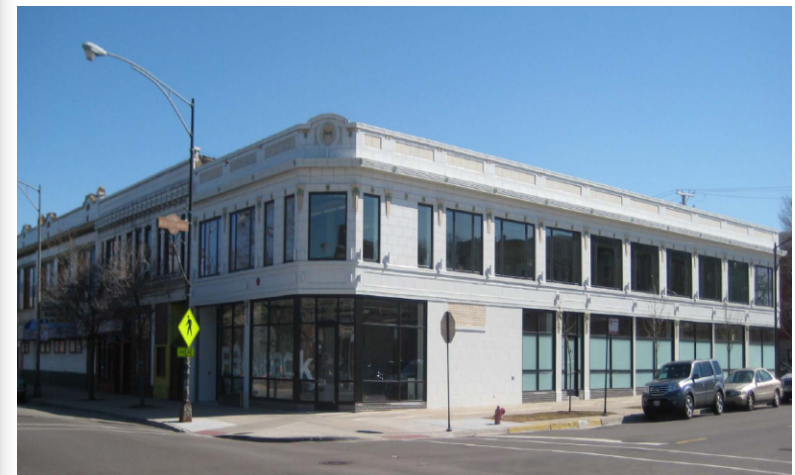
Washington Park Arts Incubator