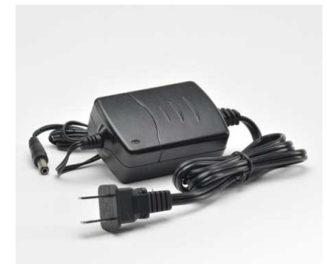
Charger Stays at Desk