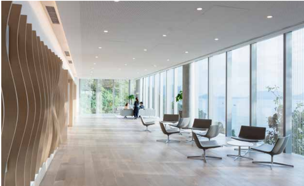
香港賽馬會芝加哥大學教育綜合大樓 — 芝加哥大學袁天凡、慧敏校園