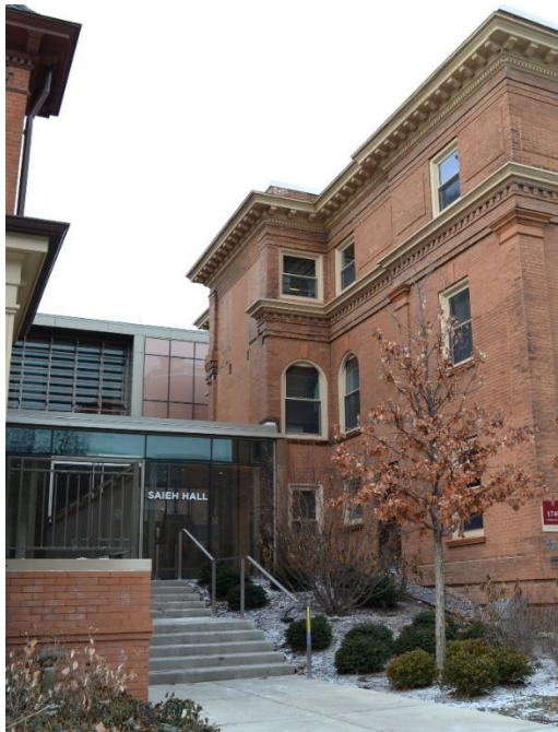
South Elevation, 2017