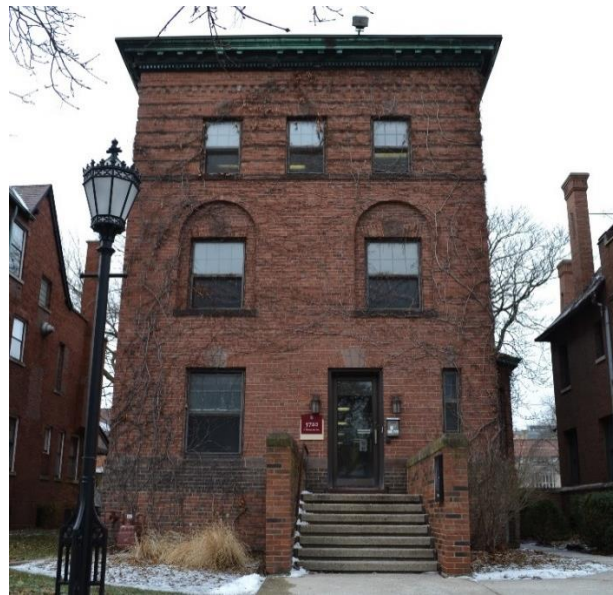
East Elevation, 2017