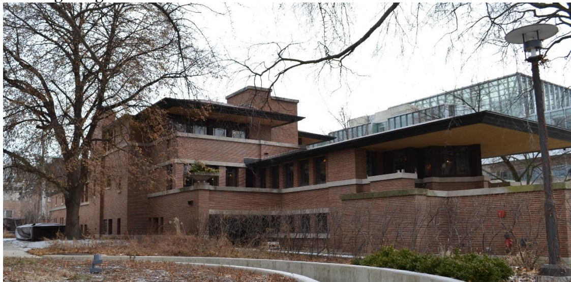
North Elevation, 2017