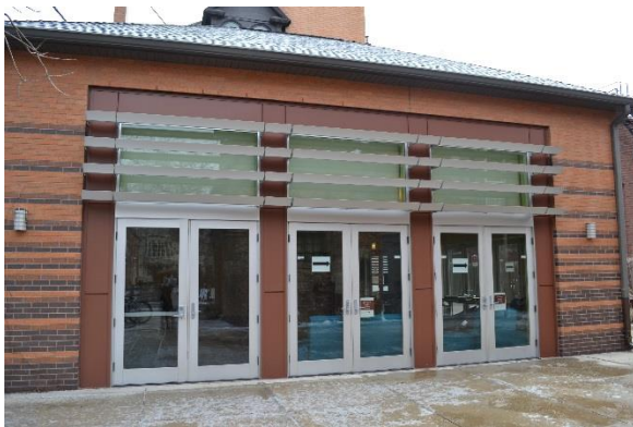
West Elevation, 2017