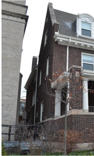
South Elevation, 2017