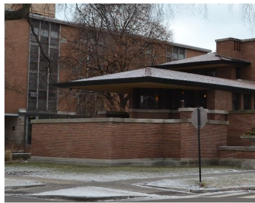
West Elevation, 2017