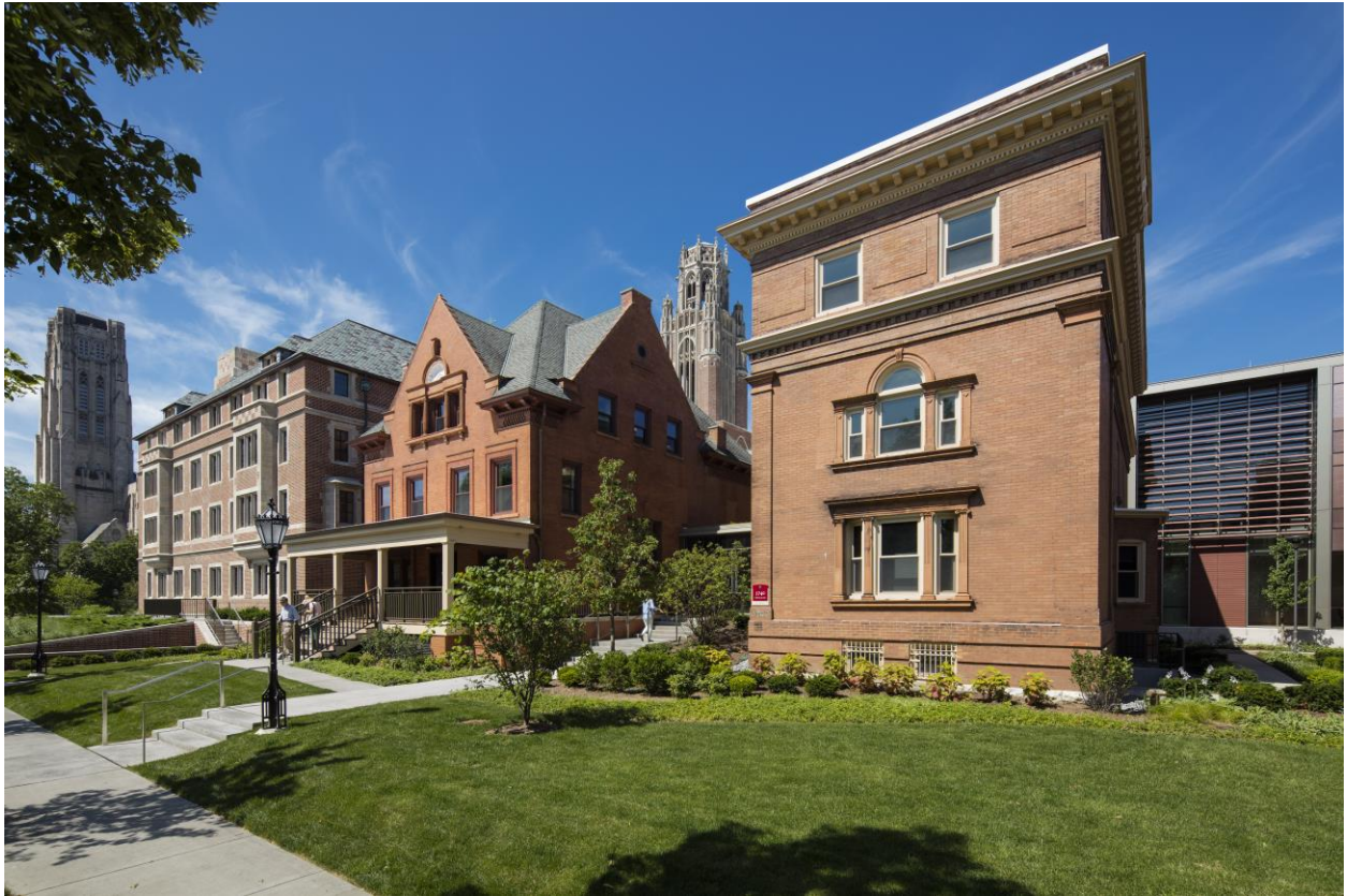
Saieh Hall, East Elevation, 2015

Plan for University of Chicago-owned properties in the 5700 block of South Woodlawn Avenue and 5757 South University Avenue