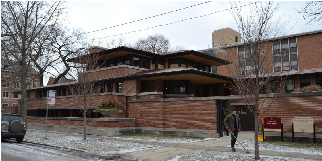
South Elevation, 2017