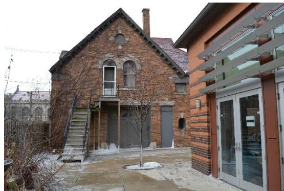
Garage East Elevation, 2017