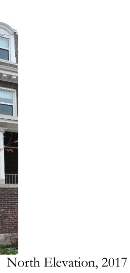
North Elevation, 2017