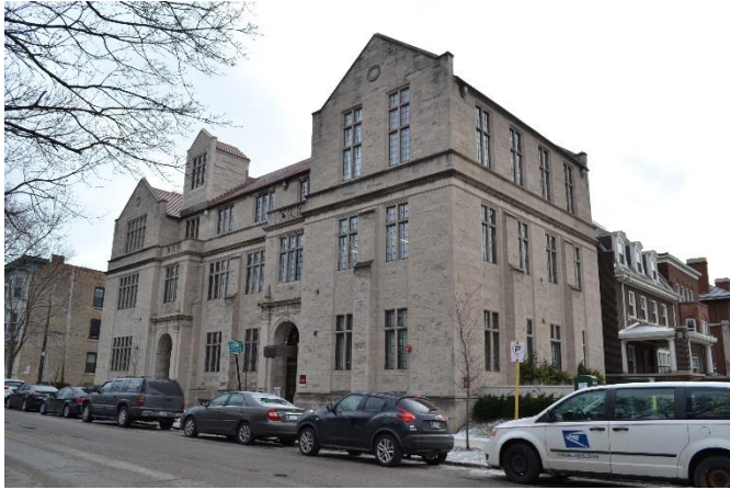
Northwest Corner, 2017