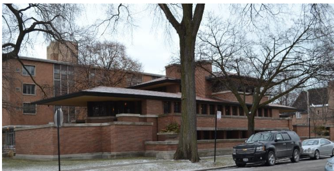
Southwest Corner, 2017