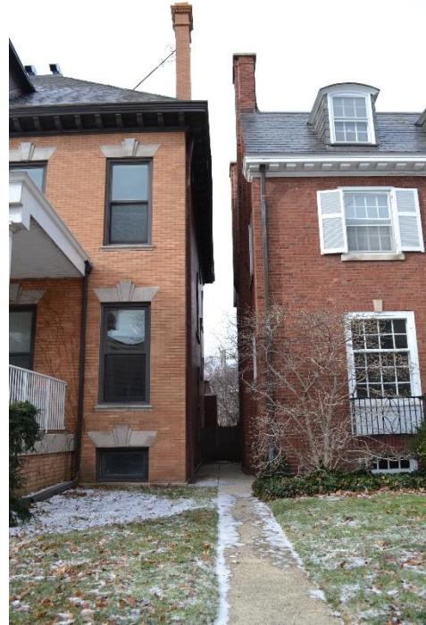
North Elevation, 2017