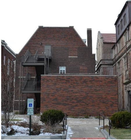
East Elevation, 2017