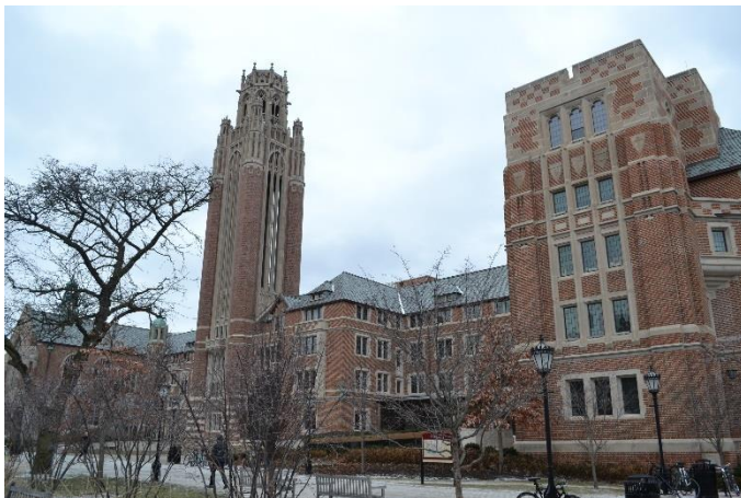
South Elevation, 2017