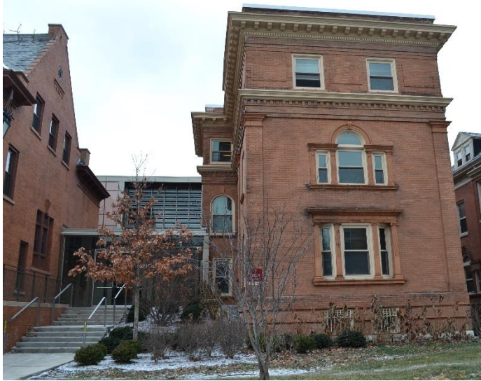
East Elevation, 2017