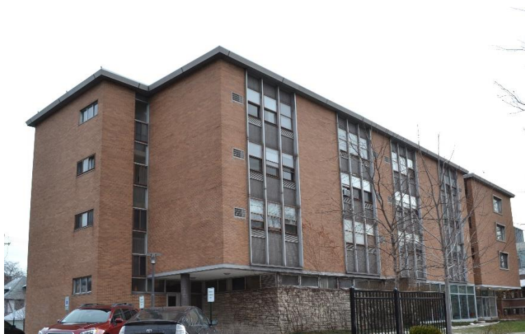
North Elevation, 2017