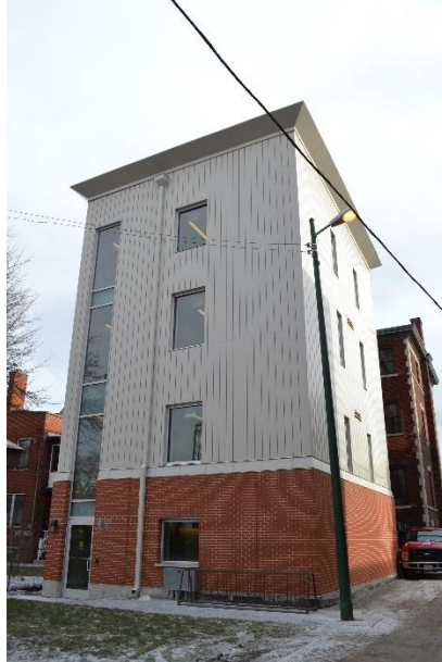
North Elevation, 2017