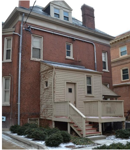
West Elevation, 2017