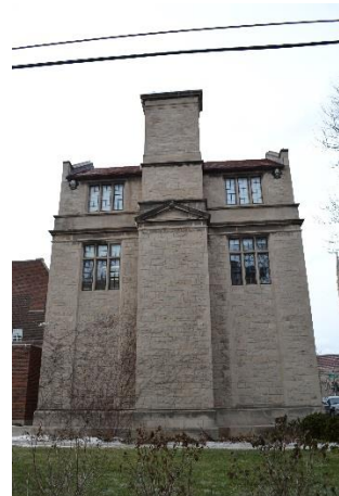
East Elevation, 2017