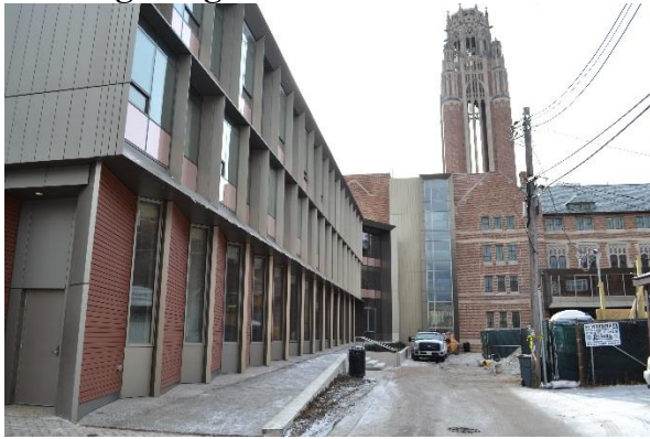
North Elevation, 2017