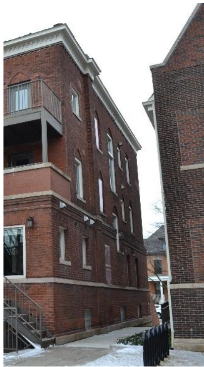
North Elevation, 2017