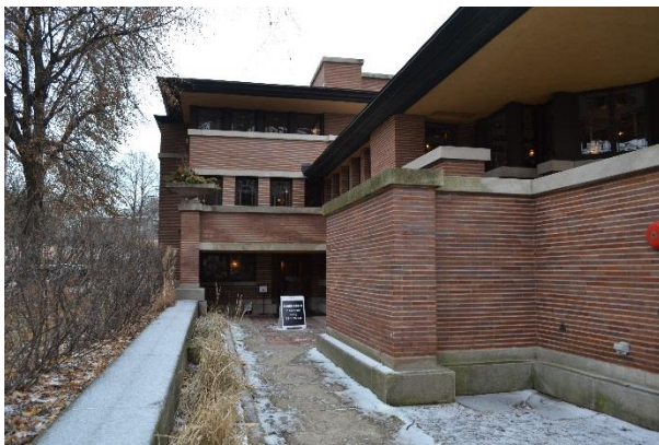
Partial East Elevation, 2017