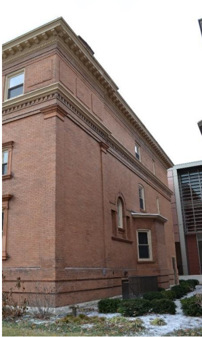
North Elevation, 2017