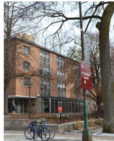
South Elevation, 2017