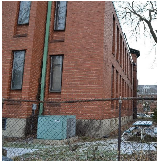
South Elevation from Woodlawn Ave., 2017 South Elevation from Alley, 2017