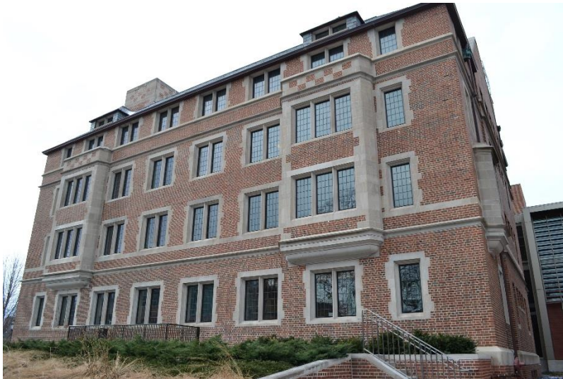
East Elevations, 2017