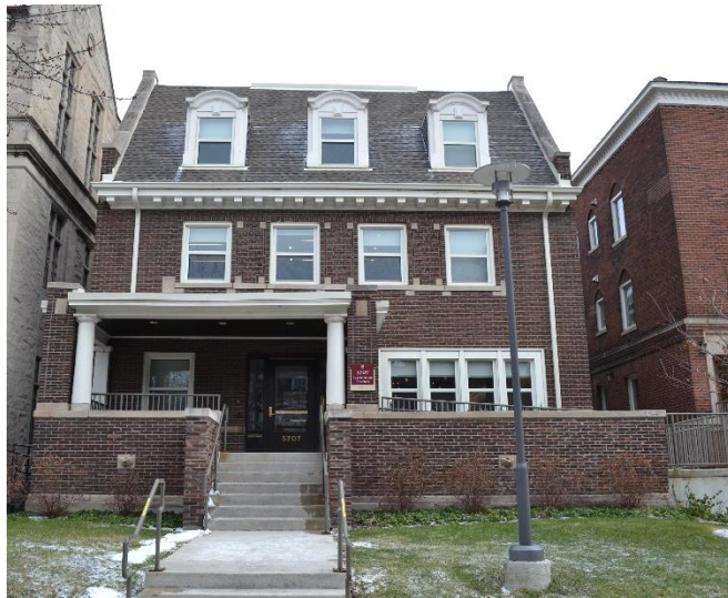
West Elevation, 2017