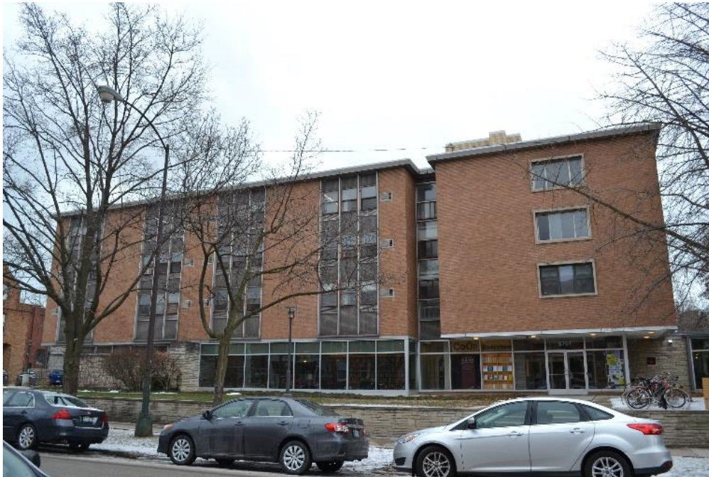
West Elevation, 2017