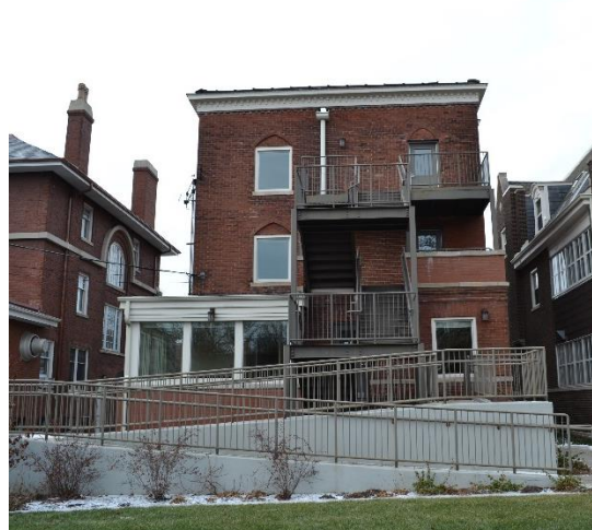
East Elevation, 2017