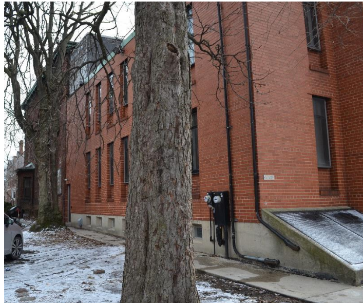
North Elevation from Alley, 2017