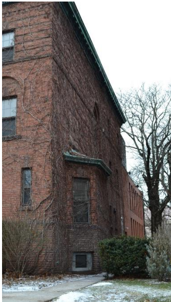
North Elevation, 2017