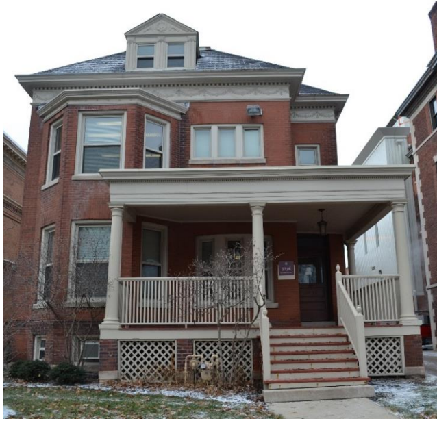
East Elevation, 2017