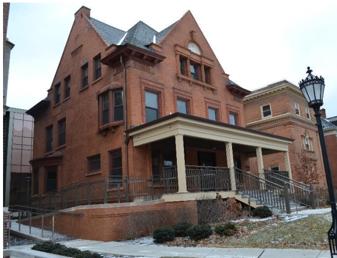
East Elevation, 2017