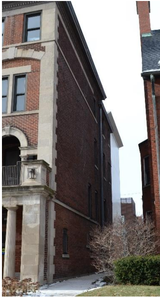
South Elevation, 2017