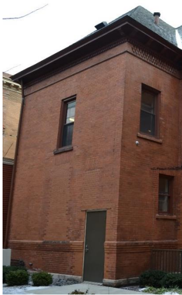
South Elevation, 2017