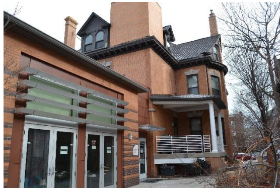
South Elevation at Rear, 2017