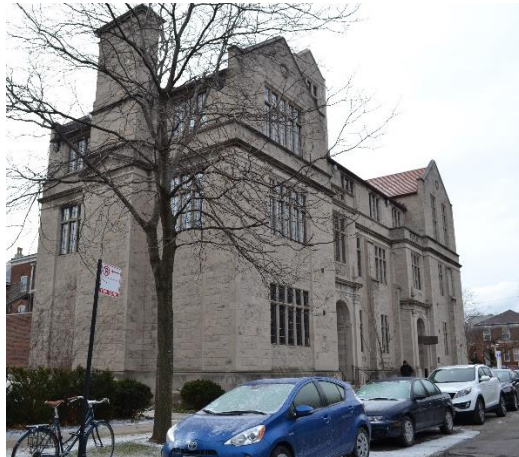
North Elevation, 2017