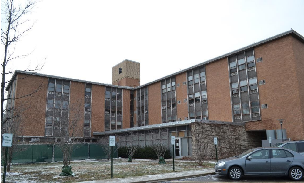
East Elevation, 2017