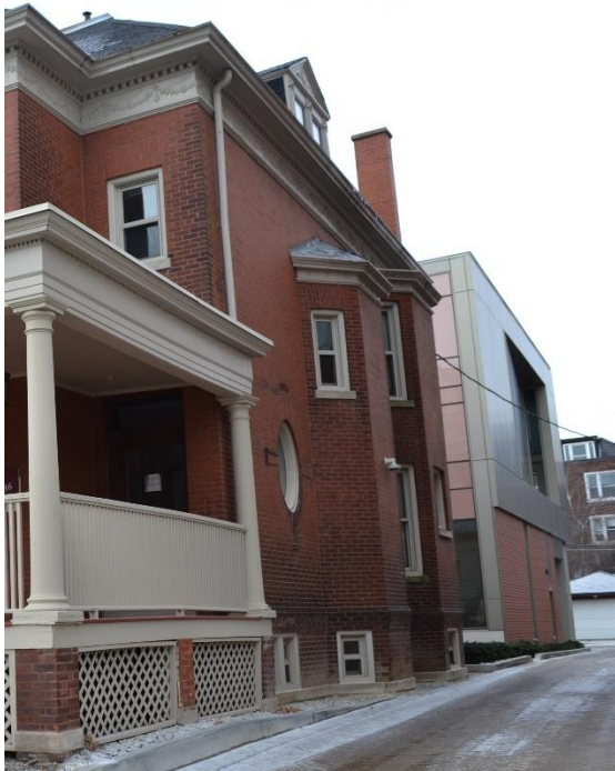
North Elevation, 2017