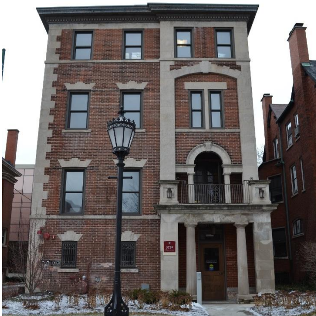
East Elevation, 2017