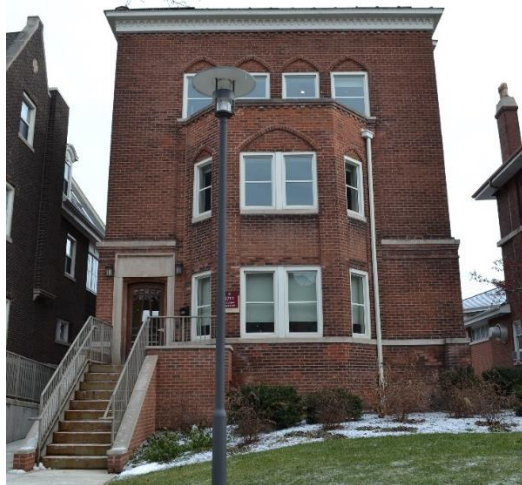
West Elevation, 2017