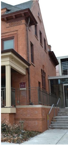
North Elevation, 2017