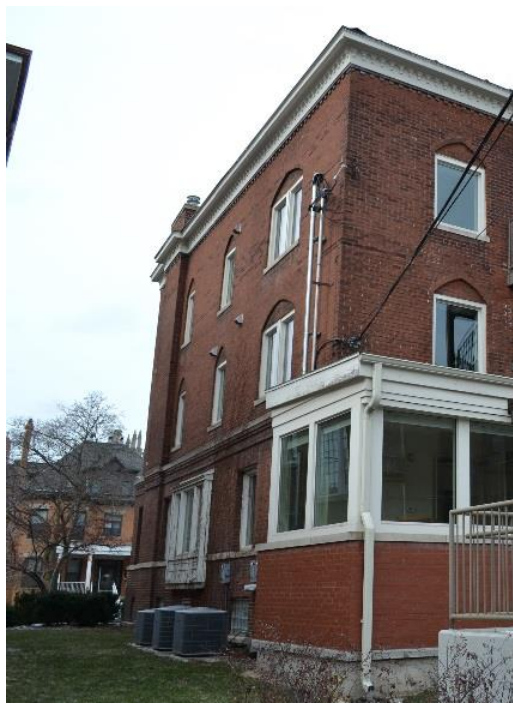
South Elevation, 2017