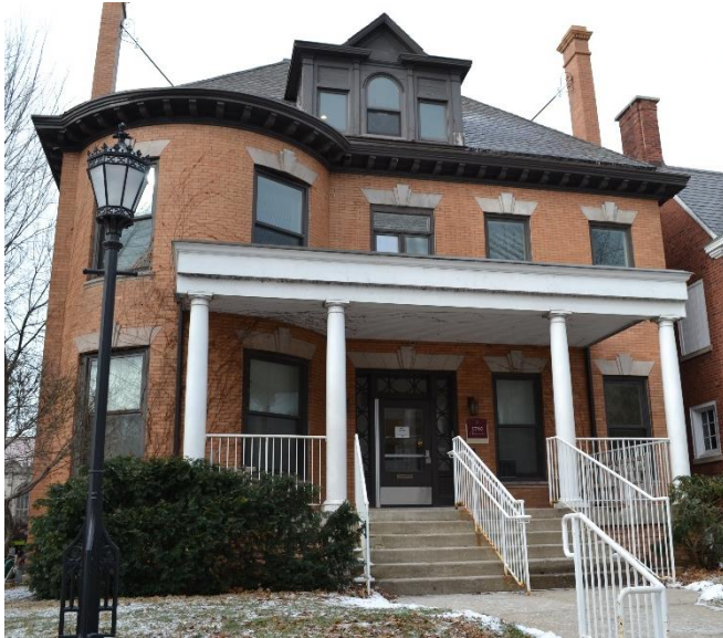
East Elevation, 2017