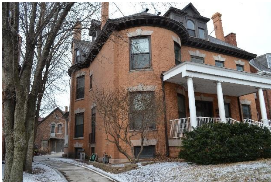
South Elevation from Woodlawn Ave., 2017