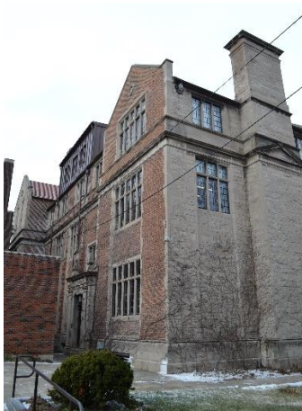
South Elevation, 2017