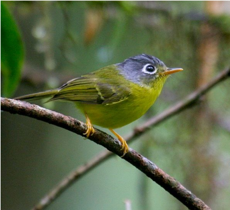
White-spectacled Warbler 1800m. Bengal. Nitin Jamdar.