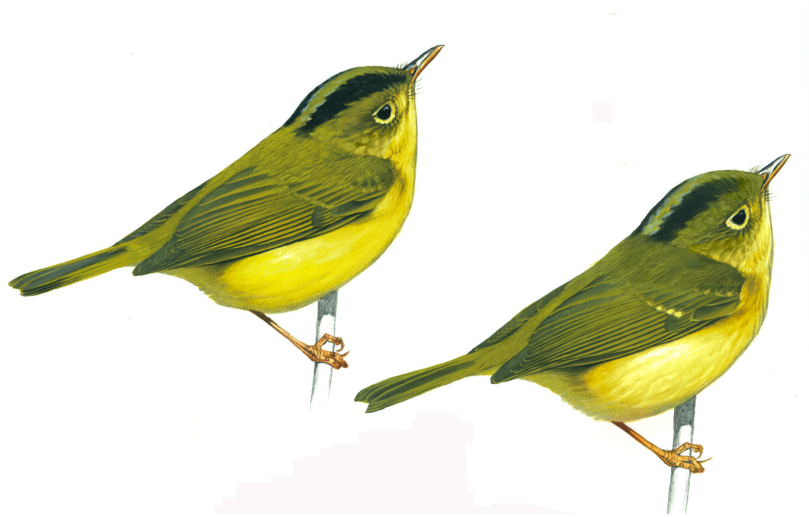
Two flycatcher warblers (Painted by Ian Lewington)