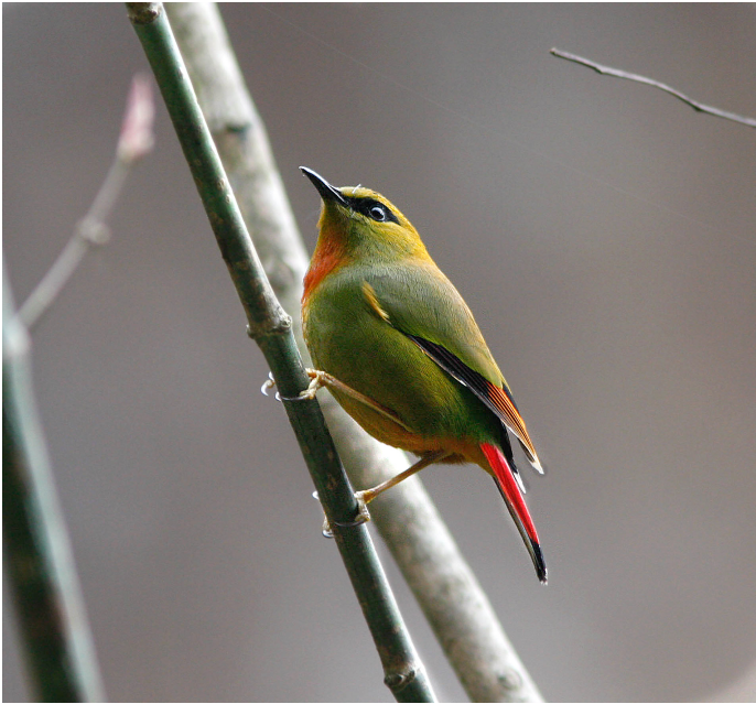
Fire-tailed Myzornis.