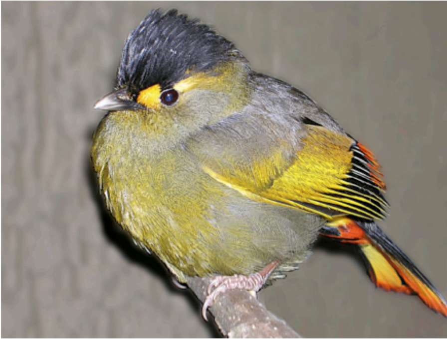
Bugun Liochichla