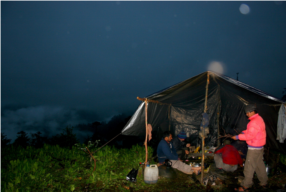
Camp Sikkim, 3600m. Nitin Jamdar.