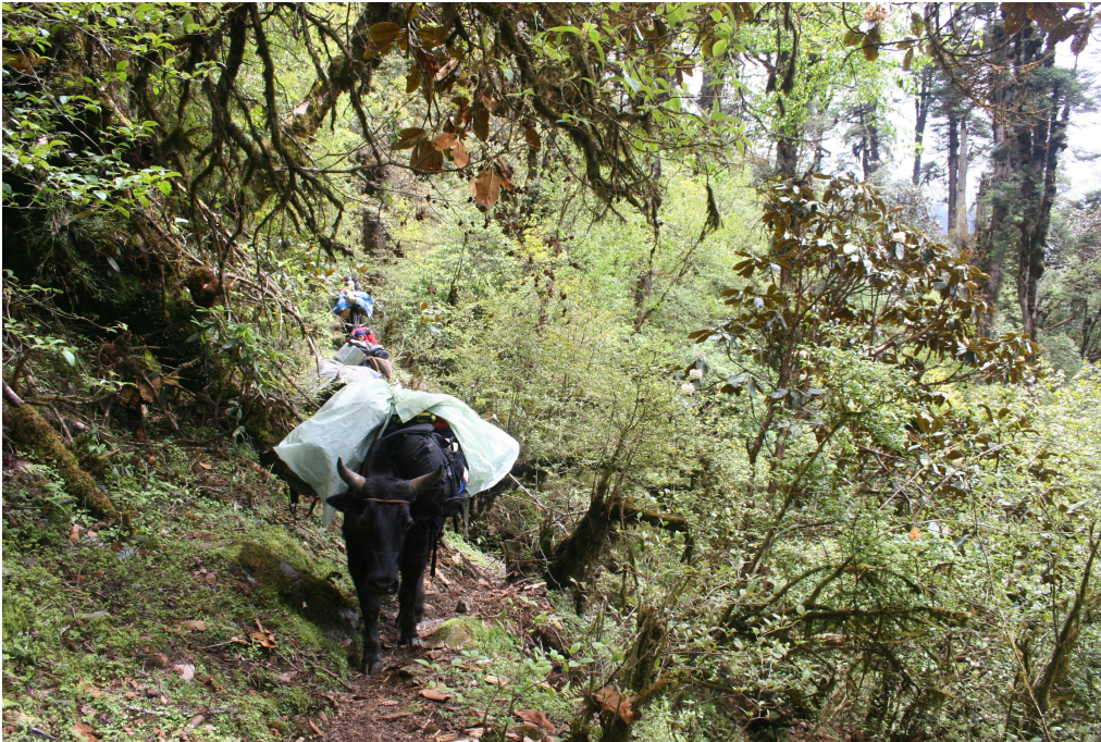
Dzos at 2600m. Sikkim.