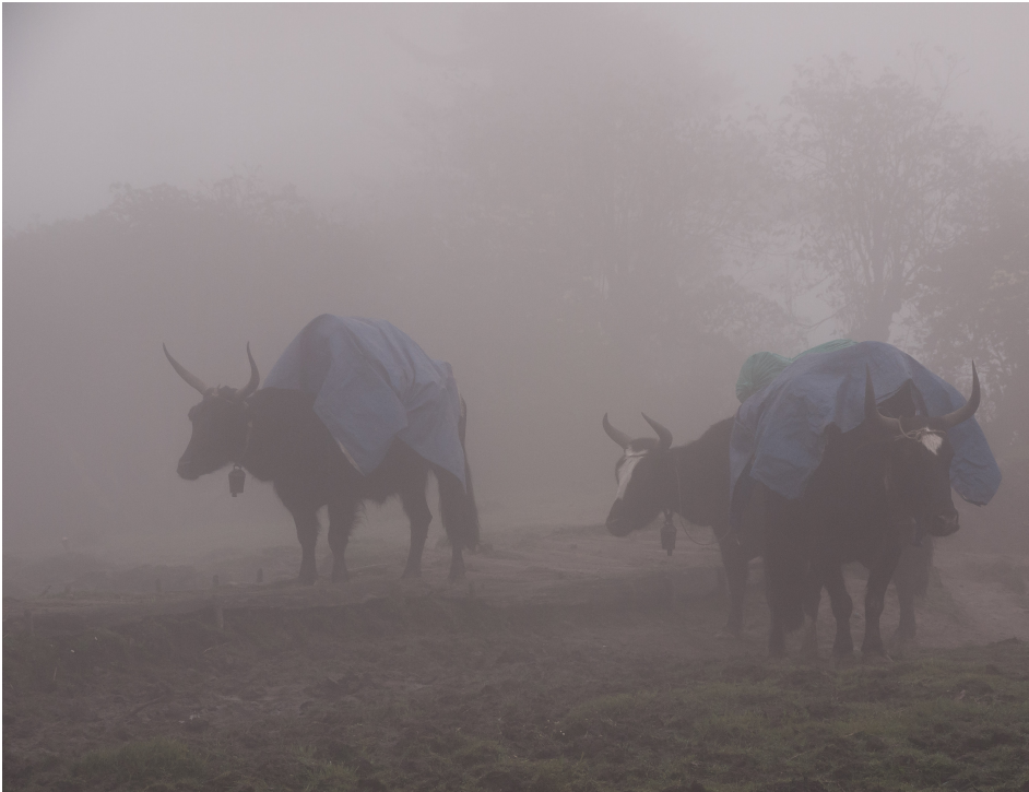
"Dzos" the male hybrid of yak/cow cross, which is the main form of transport. Mark Kirkpatrick.