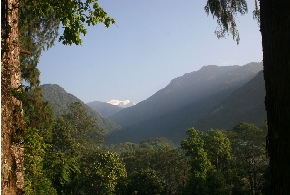
Kabru, part of the Kanchendzonga range, viewed from Yuksom (2,200m).