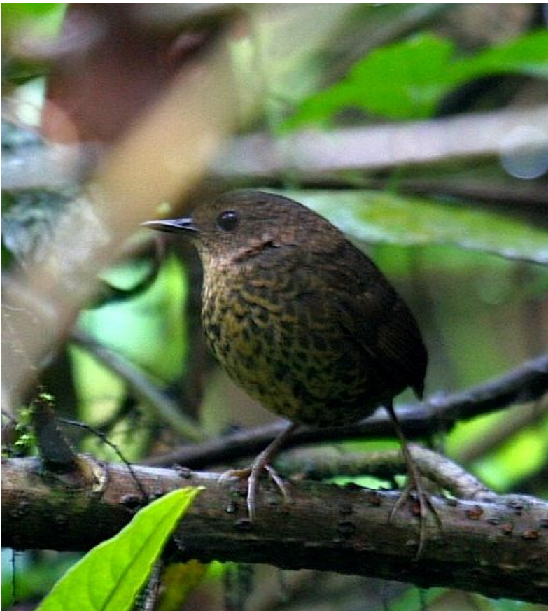
Pygmy wren babbler.