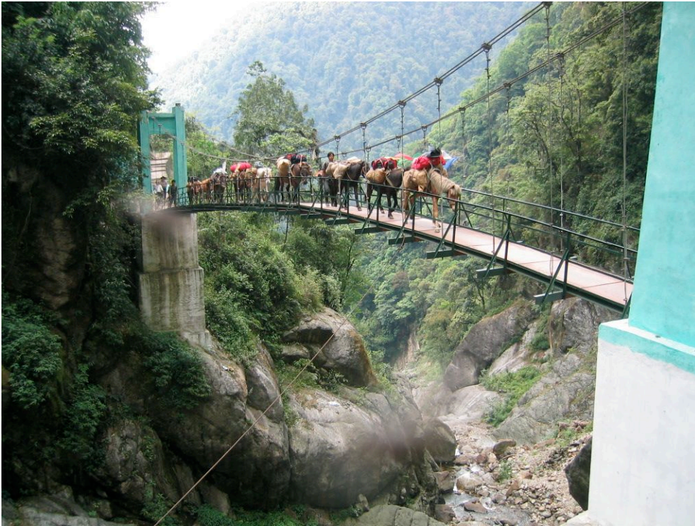
Expedition at 2,400m., Sikkim. Nitin Jamdar.