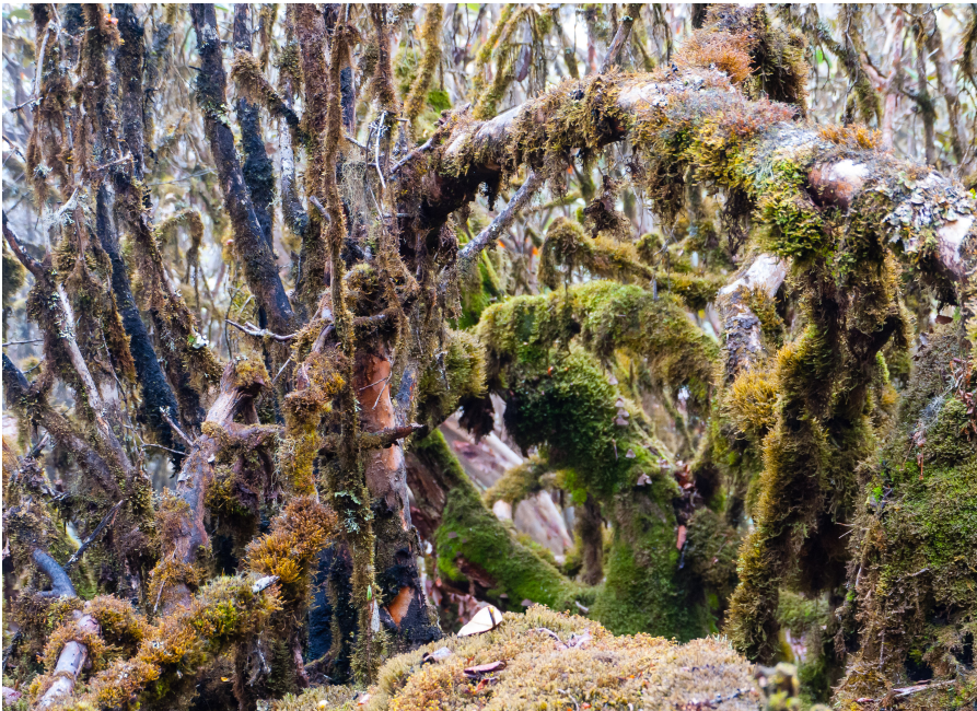
Ancient rhododendron forest. 4000m. Sikkim.