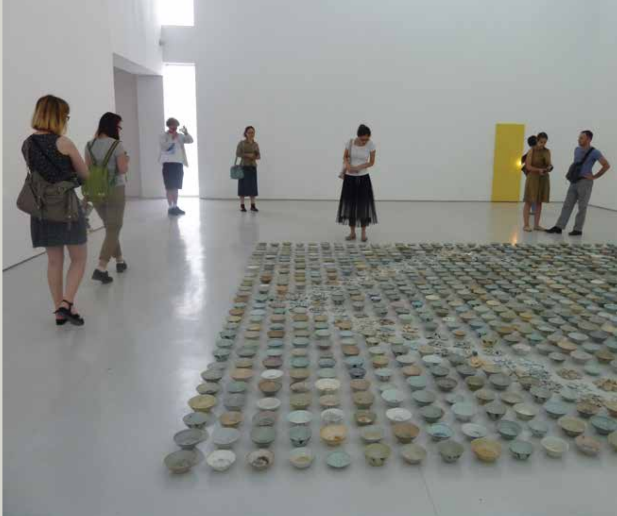
Students in the 2012 MFA Contemporary Arts Study in Beijing visit White Space Gallery in Beijing's Caochangdi arts district.