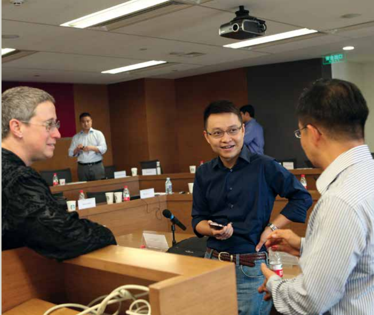
Chicago Booth faculty meet with UChicago alumni to discuss their ventures.