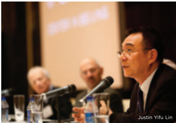
Justin Yifu Lin